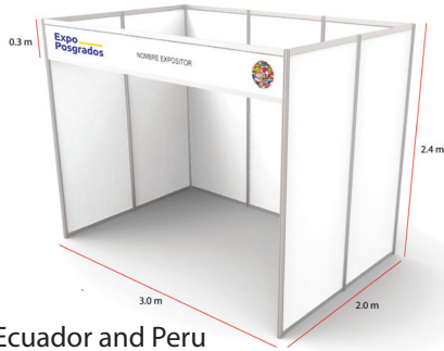
Colombia, Ecuador and Peru

We are pleased to offer a new service which allows you to professionally decorate your stand in full colour. Using BMI's managed panel printing service will allow you to attract even more people to your stand and also avoid shipping display material to Latin America and between cities. The full colour high-quality graphics are printed directly onto the panels of your stand. Pricing is based per panel, allowing you the flexibility to print the number of panels that will match your stand design and budget.